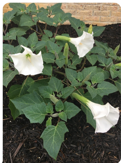
Mount Airy Clay Breakers Garden Club