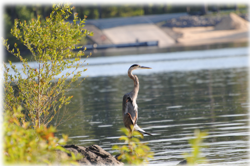
Kerr Lake – August 2020