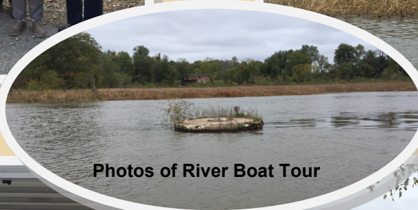
Photos of River Boat Tour