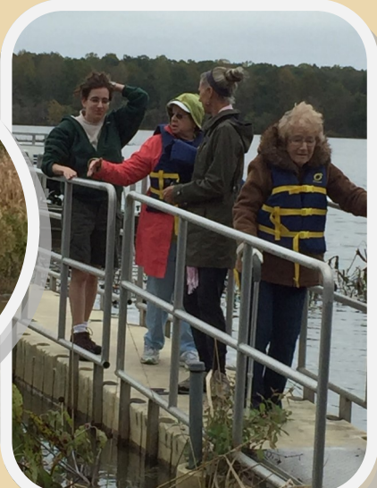
More Photos of River Boat Tour