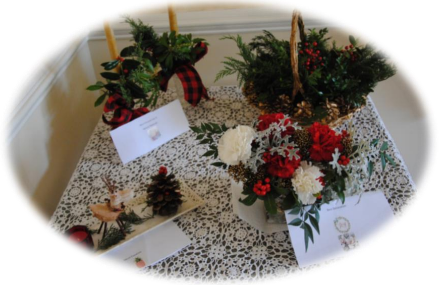
Table Arrangement - Pam Smart