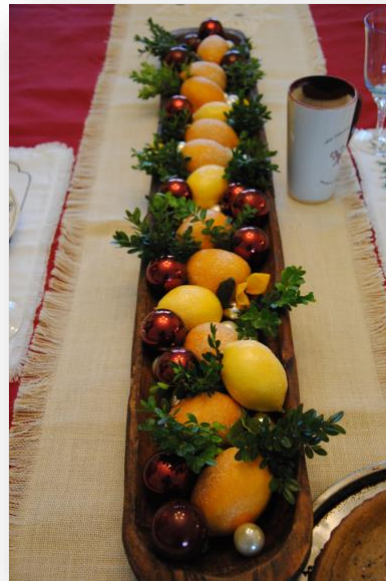
Buffet Table - Hostess Gilda Allen